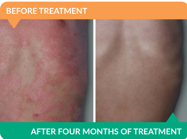
Actual 4-year-old clinical trial patient.*