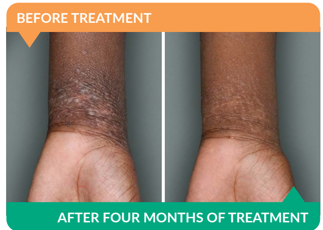
Actual 10-year-old clinical trial patient.*