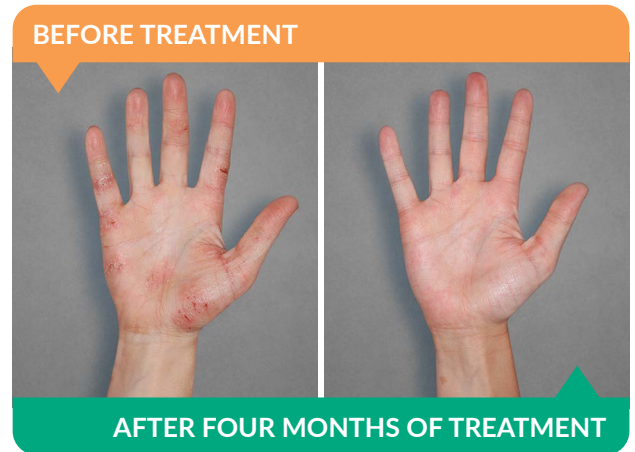
Actual, real-world adult patient. Not a clinical trial patient.†